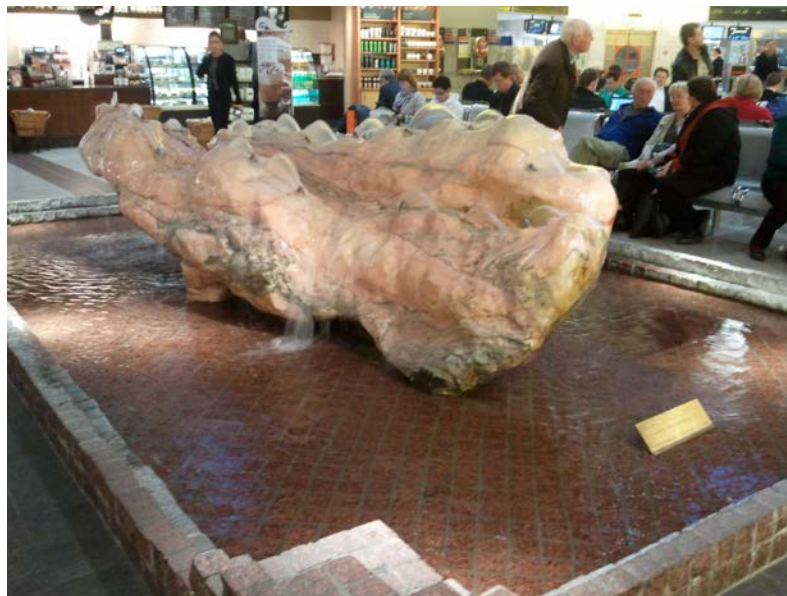
Estremoz Marble at the Vienna Airport

Executive Committee. These are: Portland Stone, from U.K., Carrara Marble, from Italy, Podpêc Limestone, from Slovenia, Petit Granit, from Belgium, and Hallandia Gneiss, from Sweden. The HSS is working hard to achieve similar good results during 2018. Complete information on the GHSR designation and reports related to the designated GHSRs can be found in the HSS web page: www.globalheritagestone.com