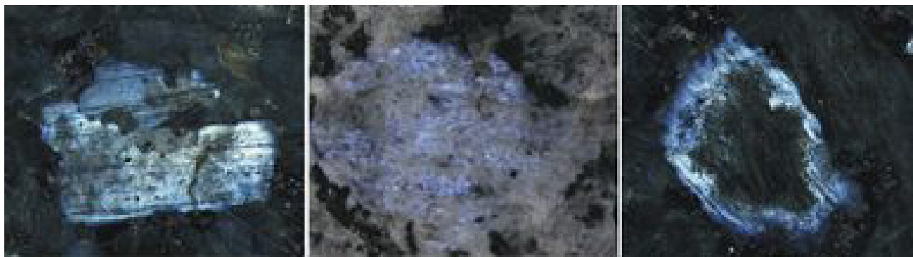
Feldspars in Larvikite