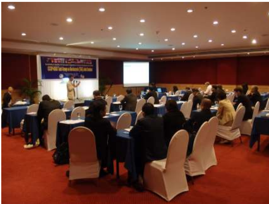
Cebu City, 18 Oct. 2017 - Seminar of the CCOP and IUGS Task Group on Geohazards

The CCOP and IUGS Task Group on Geohazards (TGG) organized a seminar on the 18th October, 2017 in conjunction with the 53rd CCOP Annual Session held in Cebu City, Philippines. Seven papers from Japan, Korea, the Philippines and Thailand were presented. Approx. 40 people from the CCOP member and cooperating countries and organizations attended to discussed geohazard research and disaster risk reduction.