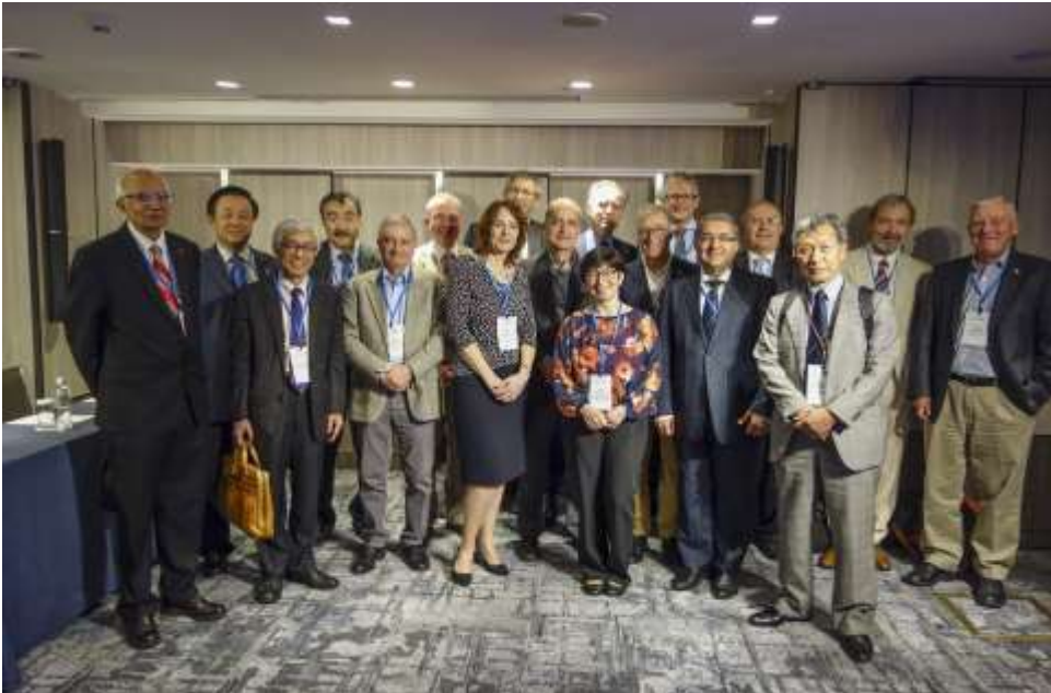
Taipei, 23 Oct. 2017 – Participants in the GeoUnions Forum preceding the ICSU-ISSC Joint Meeting sanctioning the birth of the new International Science Council.