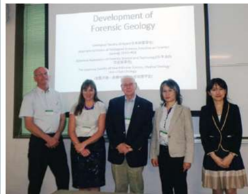
Fig 1. Poster relating to forensic geology in Japan and photo of IUGS-IFG at the International Symposium on Development of Forensic Geology, 122nd Annual Meeting of the Geological Society of Japan