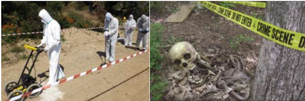
Fig 1. Applications of forensic geology: geological search for a burial (left) and crime scene examination (right)