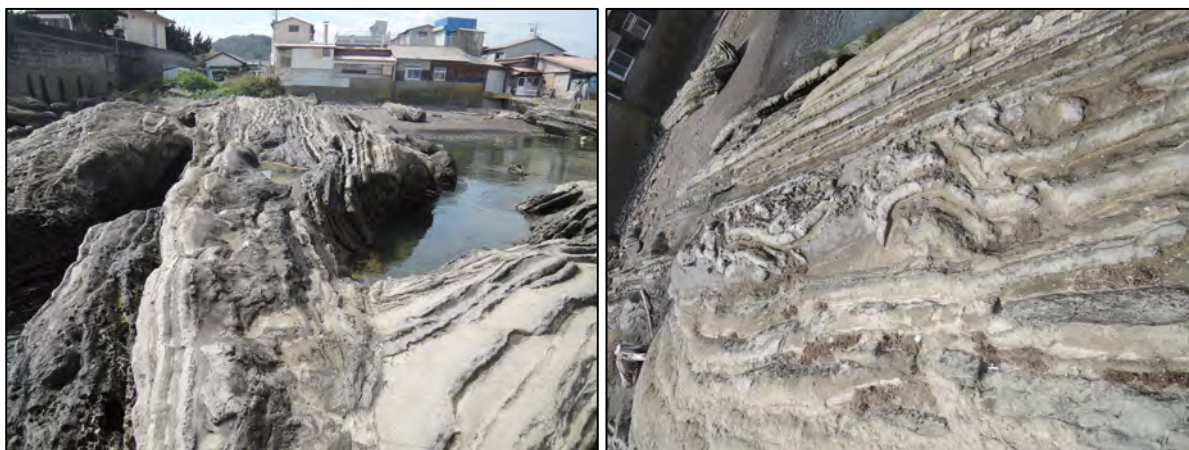
Fig. 2: Outstanding evidence for paleo-earthquake induced liquefaction.